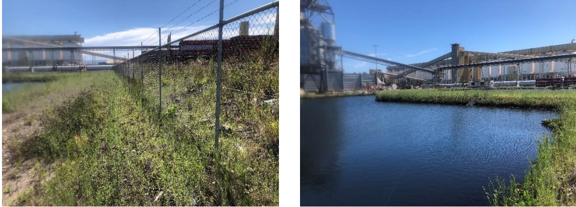
Figure 4: PKCT Lagoon