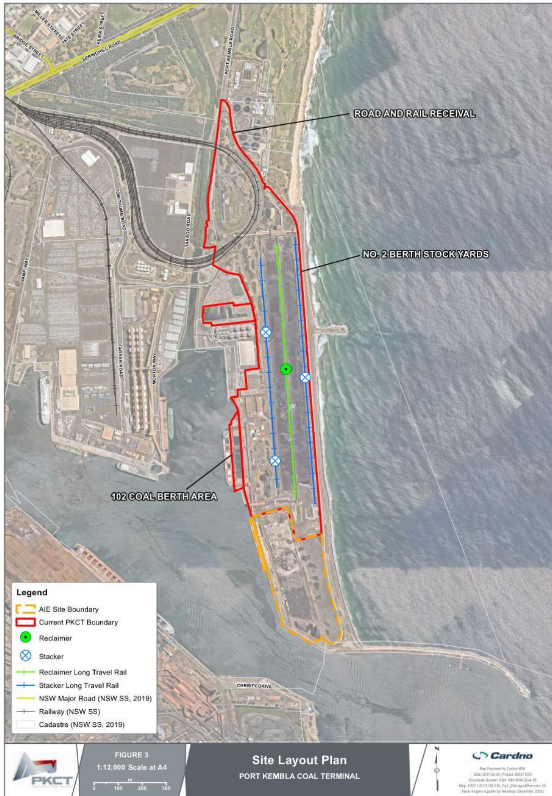
Figure 3: PKCT Site Layout

Management Plan MP.017 Status: Approved Version: 22.0 Doc ID: 386 Page 19 of 42