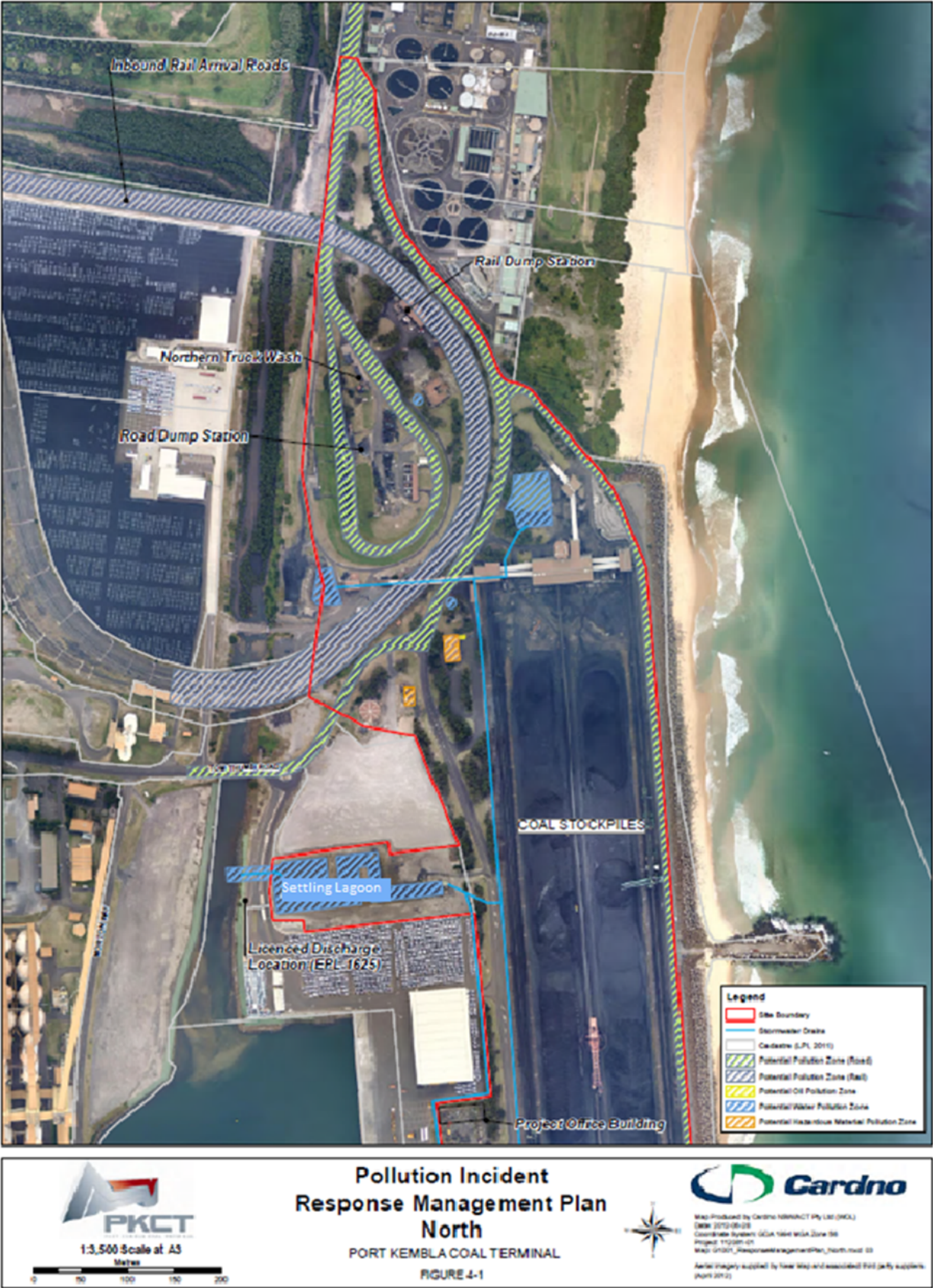
Figure 1: Northern Site Plan, Location of Hazard Zones