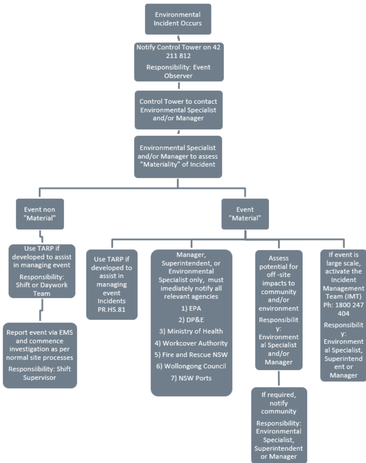
Figure 3: Environmental Event Response Process Flow