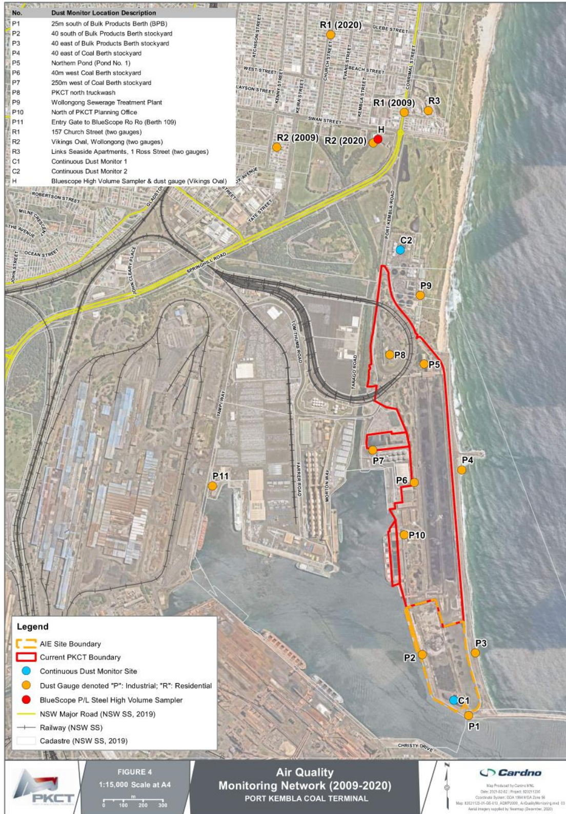
Figure 4: Air Quality Monitoring Network (2009 - 2020)

Management Plan MP.HS.386 Status: Approved Version: 18.0 Doc ID: 386 Page 27 of 45